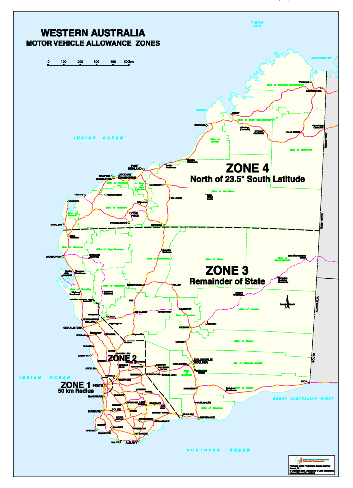
SCHEDULE 6 - MOTOR VEHICLE ALLOWANCE MAP - ZONE 1, 2, 3 & 4